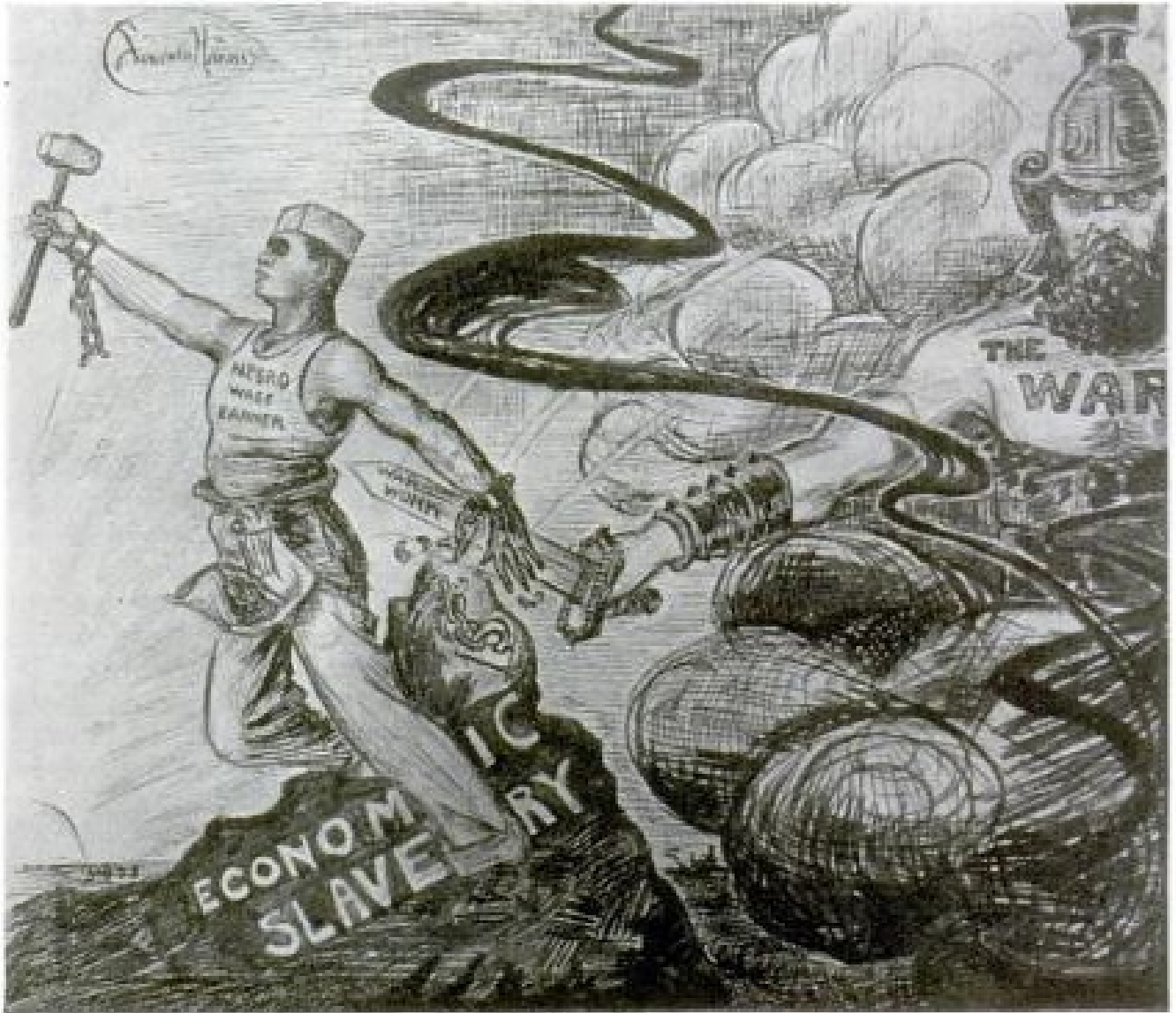
WAR. THE GRIM EMANCIPATOR

The Crisis . June 1918, 72. Accessed via GoogleBooks.