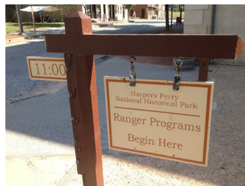
A sign that can literally stop visitors in their tracks. I've seen it happen nearly every Friday