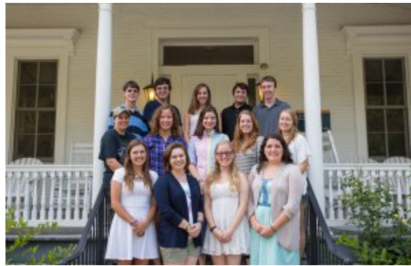
The 2015-2016 Civil War Institute Fellows are ready for action!

With the dawn of a new academic year, the Civil War Institute Fellows have returned to the trenches to prepare for yet another grueling campaign laden with risk and reward. Fresh from a summer of hard labor and riveting adventure, they are even now arming themselves with knowledge and steeling themselves for rhetorical battle.