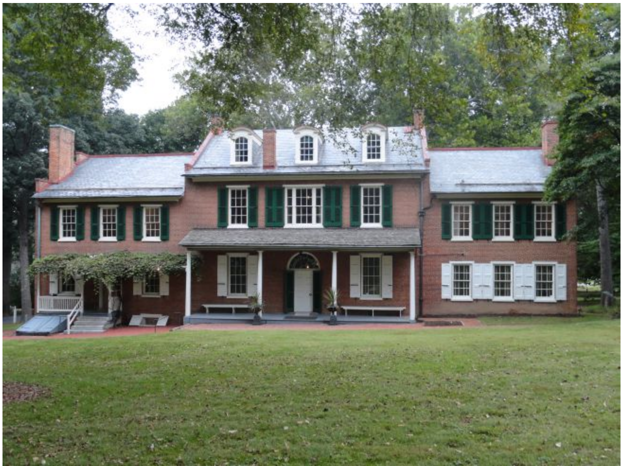
A photo of Wheatland, taken from the back yard. The house served as James Buchanan’s Lancaster home, located just next to the LancasterHistory.org Campus of History.

On Saturday, September 19 th , local citizens, historians, Civil War enthusiasts, and the rare college student alike converged at the LancasterHistory.org Campus of History for the second day of the President James Buchanan National Symposium. The theme for the symposium was “The Worlds of Thaddeus Stevens and James Buchanan: Race, Gender, and Politics in the Civil War Era,” thus it featured the lives of two of Lancaster, Pennsylvania’s most prominent historical residents and two of the most colorful characters of the Civil War era.