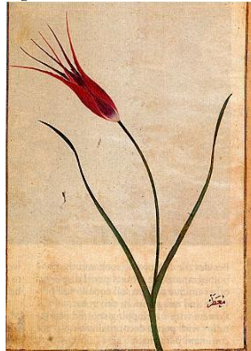
The ideal Istanbul Tulip, with almond shape and dagger petals