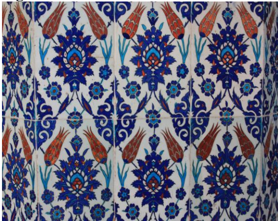
The Rüstem Pasha Mosque interior Iznik tilework.