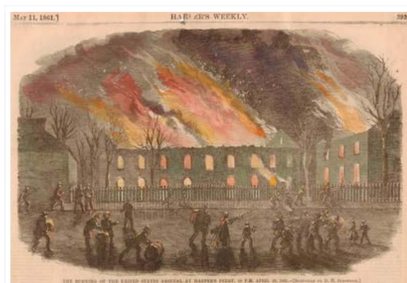
A colorized version of the burning of the large and small arsenals as drawn by David Hunter Strother from the collection at Harpers Ferry National Historical Park