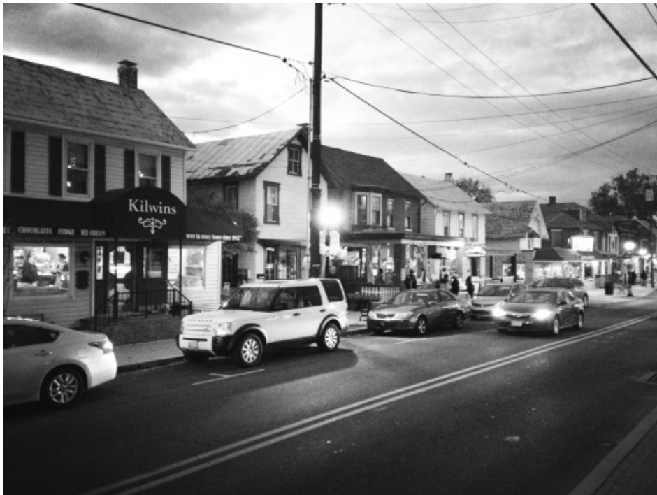
Steinwehr Avenue: Ground-zero for Gettysburg paranormal activity activities.

In conclusion, I suppose the title of this post is wrong, because I am afraid of ghosts. I am afraid of their imagined presence in Gettysburg dominating this town's historical landscape and further obscuring stories equally or more worthy of being told. I am afraid of them appropriating genuine folklore and perpetuating myths that obscure the past. I am afraid of them contributing to a sense that there is one way to experience Gettysburg: battlefield tours at day and ghost tours at night.