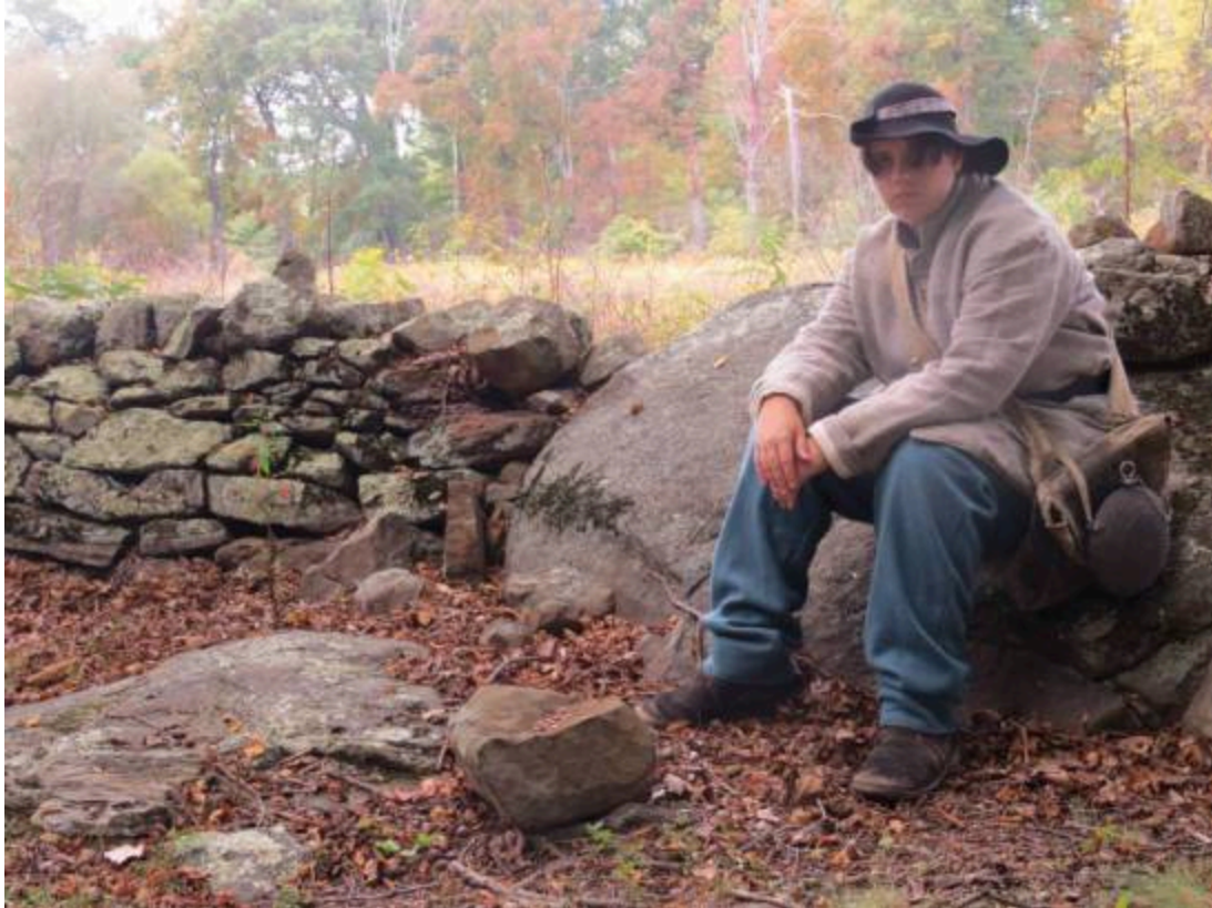
The author in uniform.