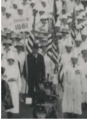
One marcher with the Klansmen sports a sign reading "Spirit of 1861."

The rally was huge. Groups from across Pennsylvania descended upon the fields of Gettysburg. The paper described the town as being festooned with red, white and blue to welcome their heroes. The Klan parade trekked through the streets of the borough, wending down Carlisle street and into the Diamond, then to Baltimore street. They turned onto High Street for a block, and then back north on Washington Street. The imposing group of hundreds of hooded figures skirted the core of the black community of Gettysburg as they marched in military lines.