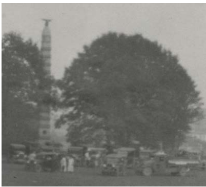
The distinctive monument of the 83rd NYSV, surrounded by Model-Ts

Imagine that story on the landscape. Imagine telling that story right along with the story of the battle. It points to the continuum of the war, to the evolution of thought and the eventual consequences of the actions of the men who fought on that land.