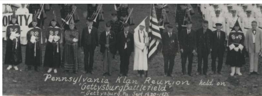
Are these GAR members alongside the Pennsylvania Grand Dragon and assorted other officers?

The most curious thing to me, though? Front and center in the image is a line of Klan dignitaries, colorful hoods standing atop their heads. And who accompanies these men? For all the world, they look to be standing beside veterans of the Civil War. Those look suspiciously like uniforms of the Grand Army of the Republic.