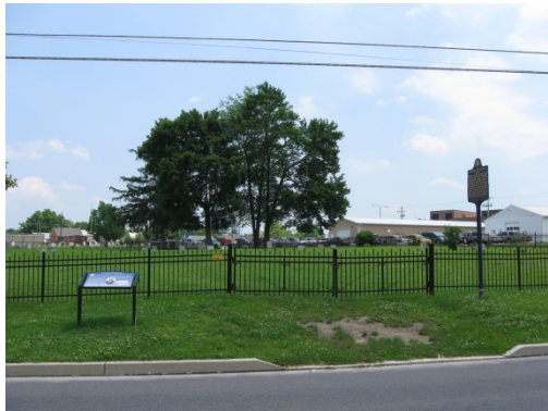
Lincoln Cemetery lies at the corner of Breckinridge Street and Long Lane.

A few weeks ago, the Hanover Evening Sun ran an article on the Lincoln Cemetery in Gettysburg and the locks which hang on its gates. This is by no means a new item of interest. The locks have girded the gates of the cemetery for three years. Still, the article (no longer on the Evening Sun's website but archived here in a PDF ) raises a few interesting questions about the delicate balance between preservation and interpretation.