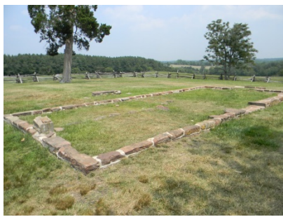
The crowd visiting the Robinson House site.

We stuck around, we dedicated and geeky few, and tried to take in the offerings. The pickings were slim. We could wait for an hour in line to buy postal dedications, eat some food from the concession (which also, thankfully, opened early), browse the family exhibit tent or linger for an hour for the first piece of organized interpretation to begin. Where was the bevy of various real-time and exceedingly powerful programming that a simple 148th anniversary at Gettysburg warrants?