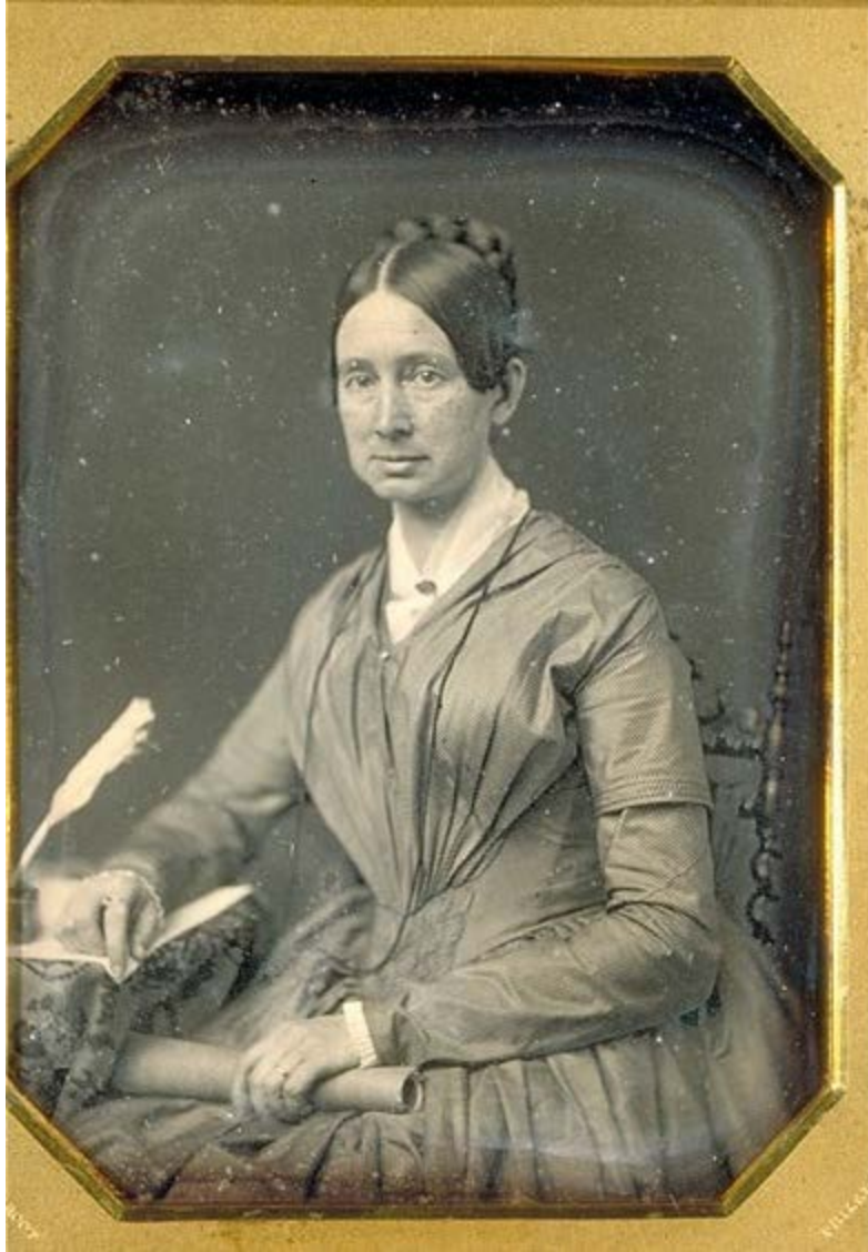
Dorothea Dix, Superintendent of Union Army Nurses.

While women were chided by Victorian society for intimate interactions with the opposite sex (their chastity being valued over their character), relationships between men were designated by a physical closeness bordering on homoeroticism that has today grown uncommon due to prejudice and notions of masculinity (but that's another story for another time). This could be seen in army hospitals as well, as male nurses strove to provide comfort and assurance to the sick and injured. For some soldiers more accustomed to Victorian social standards, male nurses would even have been preferable. Perhaps the most famous example is the poet Walt Whitman who not only nursed but brought food and money to soldiers in need, penned letters for the debilitated, and befriended his patients. Whitman wrote extensively about the relationships he formed in letters as well as his collection of war poetry, Drum-Taps , where it can be seen that he developed feelings that were more than platonic .