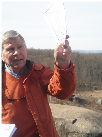
A historian emeritus from Princeton on a battlefield...