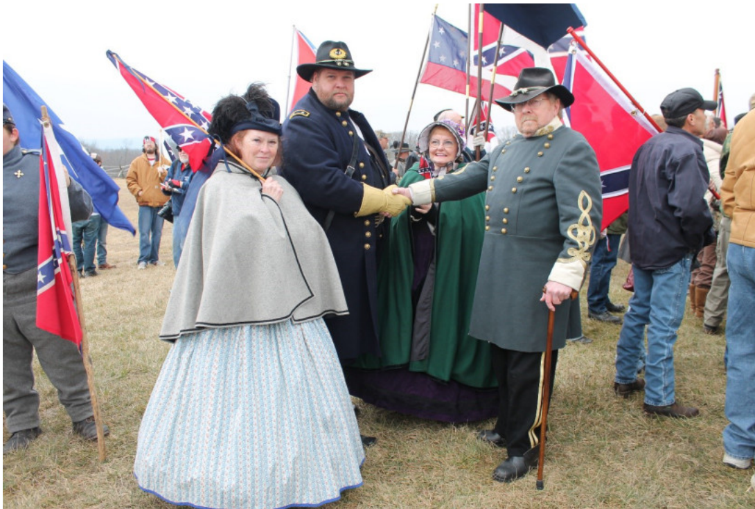
Generals John Newton and Isaac Trimble lock hands across the symbolic chasm between the countries they represent.

the other side. “The Confederates didn’t want the flag to be a racist flag,” another told me “Lincoln made it a racist flag.” I asked for an elaboration. “The government needed a way to retaliate against states standing up for their rights, so they did so by saying they were racists. Lincoln made the war about slavery, but the Emancipation Proclamation was only a war aim. Lincoln did nothing about slavery in the Northern states.” In the background, people around me began to sing “Dixie.”