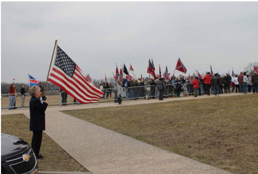
A woman stands with her father’s WWII burial flag, reminding protesters on both sides that we are, after all, a united nation and have been for over 150 years.

One of my motivations for attending was to try and understand why hundreds of people would come out on a cold, damp Saturday to support the Confederate flag. With this curiosity, I ventured across no man’s land to get the perspectives of some of the pro-flag demonstrators. In doing so, I came across an older woman standing between the two barricades holding an American flag. She stood as still as a monument, the flag slowly waving in the light breeze. She said she was standing there to remind people on both sides that we are a united nation, that “we are Americans first, Democrats and Republicans, Northerners and Southerners second.” She told me that the flag belonged to her father who served at Okinawa and was the same flag that he was buried with.