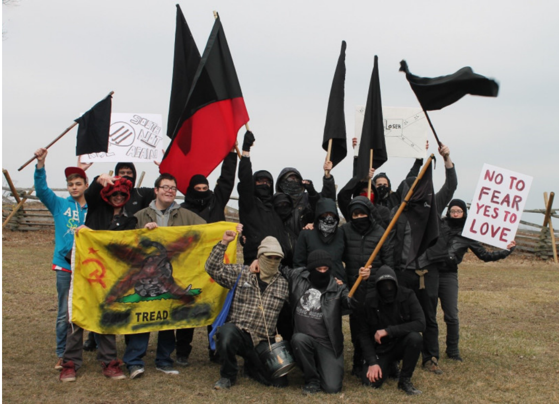
Facebook activists from all over the region also showed up to protest the Confederate flag rally.

At first, I could not help but feel a little angry at this hodgepodge group who seemingly had hijacked our quiet and peaceful anti-flag protest. I knew that the efforts of the silent anti-flag demonstrators that I had marched up with would be undermined by the fact that now our entire side would be entirely identified as a bunch of ill-mannered activists. It wasn't until a few days later that their message really set in for me. They had shown up to demonstrate their freedom of speech, just like myself and the pro-flaggers on the other side. These radical protesters used that freedom to insult Confederate flag sympathizers with foul language and ad hominem attacks. Simply put, they were being offensive in an entirely legal way. The same could be said of the pro-flag demonstrators, as they too demonstrated their First Amendment right to proudly display a flag that to many Americans is an offensive symbol of oppression and hatred. The black-clad protesters had effectively turned the tables on the flaggers.