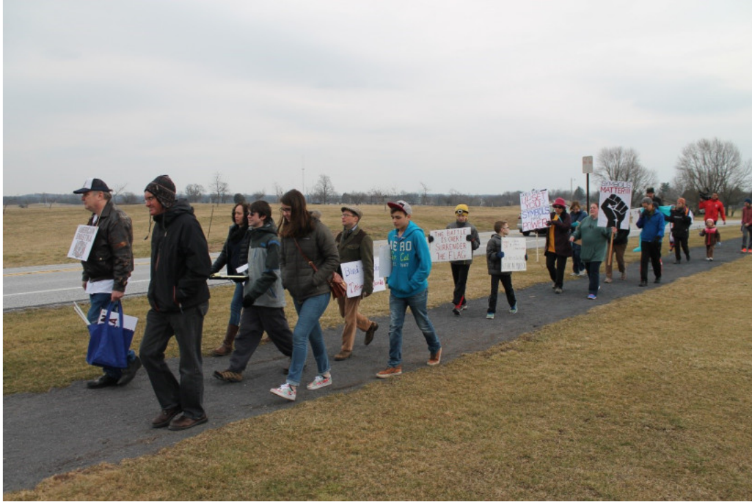
After gathering at the Lincoln statue, we marched up to the Peace Light, getting honks of approval from cars that drove by.

When we arrived at the top of the hill, we saw that there were two demonstration areas set up by the National Park Service. The Sons of Confederate Veterans stood behind a police barricade to the left of the Peace Light. Fifty yards away, anti-flag protesters stood behind their own police barricade. We were not the only group who showed up to oppose the flag rally. Roughly 20 other people were already there dressed mostly in black and covering their faces with balaclavas and bandanas. They organized their demonstration via Facebook and came from all over the region – Baltimore, Reading, Frederick, Altoona, Carlisle, and Washington D.C. – and had no leader or name. Wielding black flags and megaphones, they shouted chants like “The South will not rise again! Your heritage is hate!” and “Hey hey! Ho ho! Your racism has got to go!” Other chants were not so polite. Those who had megaphones frequently hurled expletives at the pro-flag demonstrators, much to the chagrin of many attendees on both sides. These remarks were invariably answered by similar language from the pro-flaggers, but their words could not penetrate the wall of noise from the megaphones.