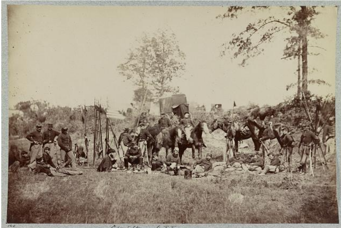
A photograph taken of the 6th PA Cavalry by Matthew Brady. Note their lances!