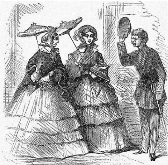
After GENERAL BUTLER'S Proclamation.

General Benjamin Butler enforced harsh discipline on the people of Union-occupied New Orleans; he is noted for threatening to publicly denounce women as prostitutes if they acted out against his soldiers. This editorial cartoon illustrates the resulting change in behavior.