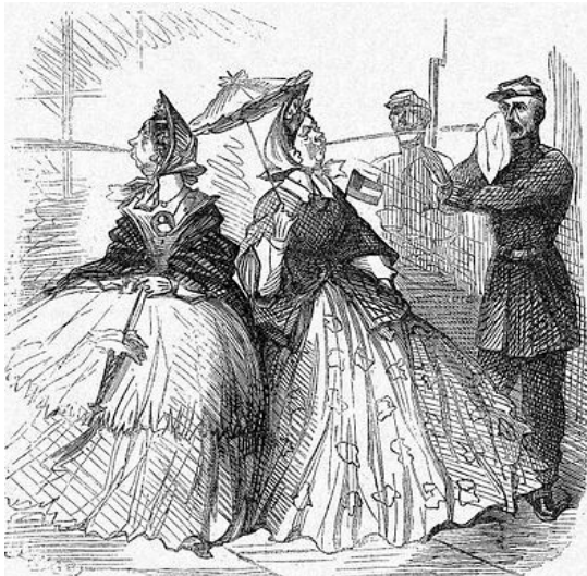
THE LADIES OF NEW ORLEANS before GENERAL BUTLER'S Proclamation.