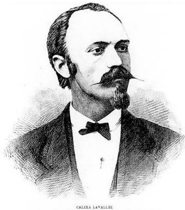
Calixa Lavallée in his later years, defying typical post-war facial hair trends.

Of course, not all Canadians who partook in the war were there to fight. Among the number who volunteered in the Union army was a young musician by the name of Calixa Lavallée, who some two decades after the war became responsible for one of the most enduring symbols of Canada (at least as we perceive it here in the United States): the music of their national anthem, "O Canada." Born in Quebec to parents of French descent, he was only sixteen when he traveled to the United States for the first time to join a traveling minstrel show based out of Rhode Island. Already an extremely versatile musician, he journeyed across the politically-tense nation to cities like New Orleans, Vicksburg, Richmond, Washington, Philadelphia, and New York to perform on tour. On 19 January, 1861, Lavallée and his troupe were in Atlanta when Georgia seceded from the Union.