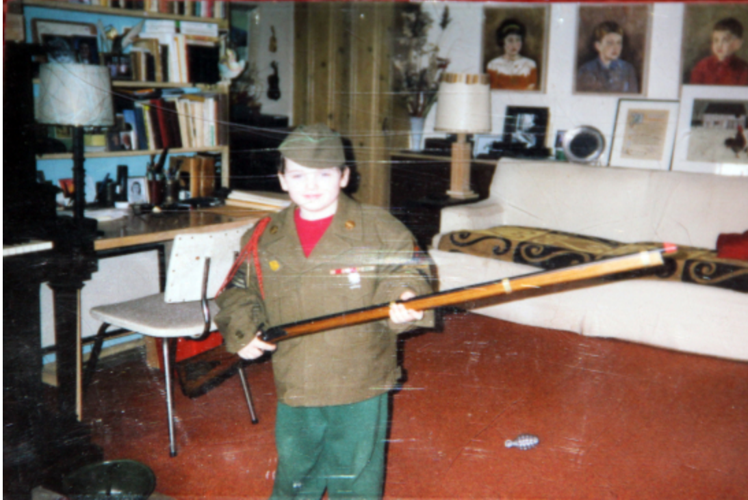
The author as a child.

Sadly, we still suffer from this all-too-human tendency to jump at the shadows of the past, to let our nightmares fill in the gaps in our knowledge. Too often in recent years we have found ourselves lead around by the nose, ceaselessly rounding a circle of blood and woe that stops us from believing that people can ever make peace and mean it. But we must remember that people can change. Eighty million Germans did; my grandfather got to see that change before he died. He traveled a Europe at peace, wearing a suit in place of his uniform. He carried a canvas instead of a carbine. And he was glad of it. He never once spoke ill of his former enemies to me. He knew all too well the horrors he witnessed, and, I sense, that because of that sad knowledge, he knew that such horror must be consigned to history, even if that meant him placing an immense amount of faith in strangers.