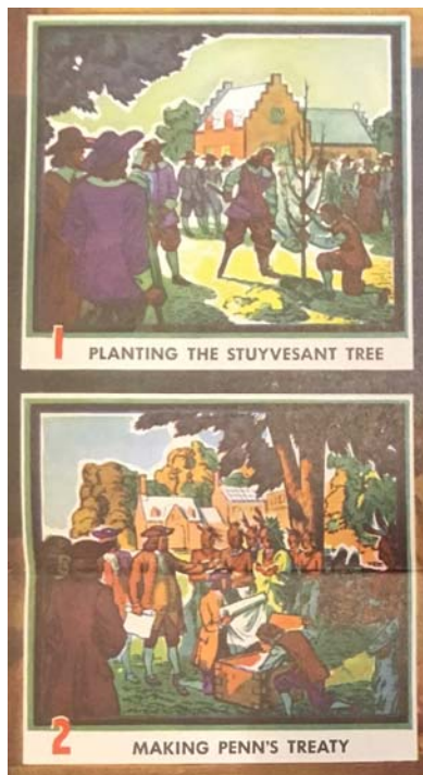
Figure 1: The Stuyvesant Tree and Penn's Tree

Other examples of this can be found in the workbooks that went along with the posters. The workbook on American transportation includes mini-lessons on the Erie Canal and the use of wagons in America's westward expansion. The paragraph on westward expansion states, "the pioneers who moved westward in covered wagons did not know that the slow movement of the clumsy vehicles meant the building of a new and greater America, but they built into our Country their strength, their courage, and their hope." 61 This celebratory tone promoted a triumphal version of the United States' history, and asserted an understanding of America as exceptional and its people as embodying attributes such as strength and courage. Similar to the facts on the wood poster, then, this lesson functioned as a reminder of the positive deeds of past Americans, and reminded American students of their shared history.