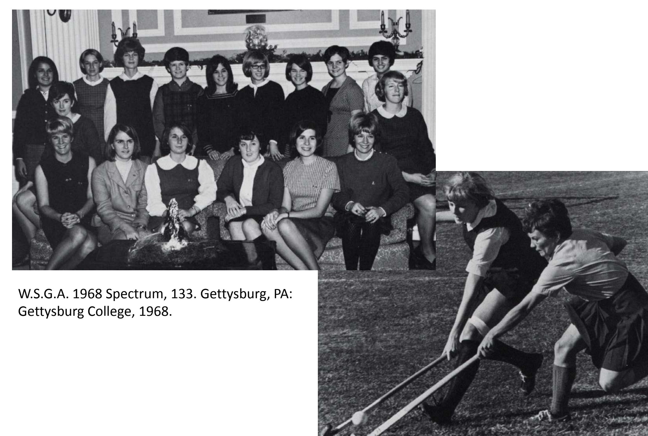
W.S.G.A. 1968 Spectrum, 133. Gettysburg, PA: Gettysburg College, 1968.

The goal of the project was to understand the experiences of Women at Gettysburg College from 1965-1975. All areas of student life were examined: academics, activities, Greek Life, clubs, athletics and residence life.