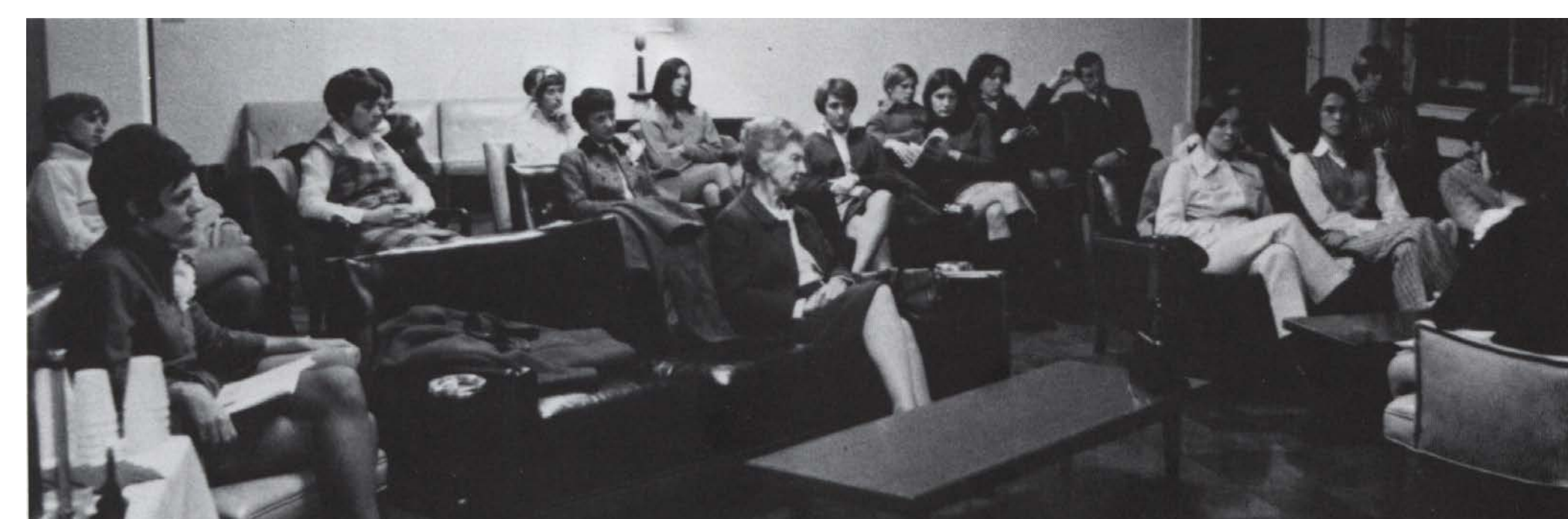
Women's Student Government. 1970 Spectrum, 85. Gettysburg, PA: Gettysburg College, 1970.

"[the rules were] unfair, too strict, singled [women] out from men. I understand the desire to keep women 'safe,' but seriously!! Women were coming from homes with no such regulations. Hours were 'over the top!'"