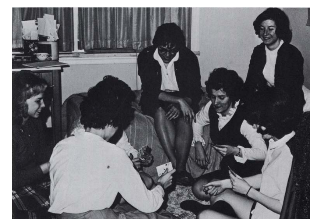
Women in the Dorm. 1965 Spectrum, 45. Gettysburg, PA: Gettysburg College, 1965.

Between the Fall of 1964 and the Spring of 1975, 2,399 women attended Gettysburg College. The number of men was 4,812. While women attended Gettysburg College, they faced discrimination in many aspects of college life. A Sleep-In was organized on March 15, 1969. This event can be viewed as a turning point for Women's Rights at Gettysburg College. During this period, Gettysburg College was relatively conservative, politically and socially. Students were affected by the changing cultural climate, but Gettysburg College was nothing like Berkeley, Columbia or Kent State.