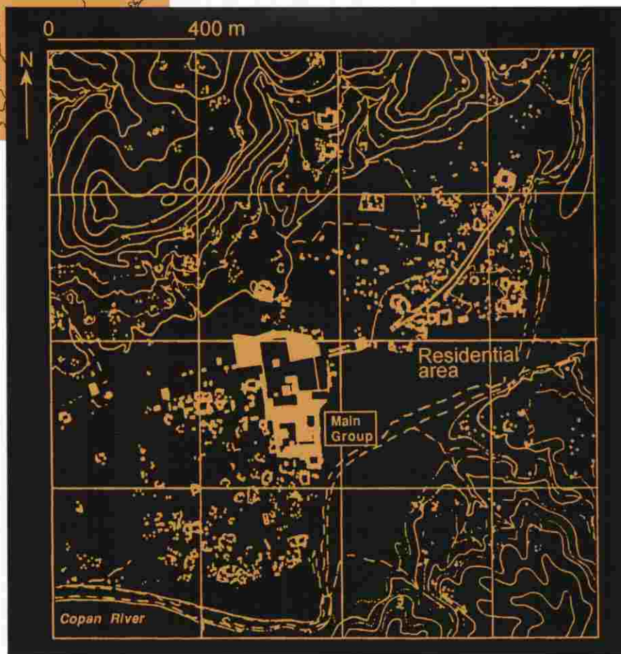
BELOW: Settlement in the Copan Valley showing the densely settled residential zone surrounding the royal precinct. The figurines discussed here come from the eastern section of the zone.

palaces, a ball court, and carved monuments. They used hieroglyphic writing to record their achievements and monumental sculpture to create large-scale images of members of the royal house.