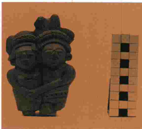
One of the couple figurine-whistles. Note how the artist placed the man and woman's earspools one above the other. While this may have been done to solve a technical or design issue, the clasped arms of the figures also reinforce the viewer's sense of emotional closeness.

Figurine faces do not look like portraits of individual people. Instead, they seem to represent two types or categories of people. The first type, which is by far the most common, is someone with an unlined face and a calm, dignified expression. These figures look young, but are not children. To me, these faces look like people in “the prime of life,” old enough to be full-fledged active and vigorous adult members of society. Their eyes and mouths may be open or shut. If the mouth is open, the makers of the figurines were careful to delineate the teeth.