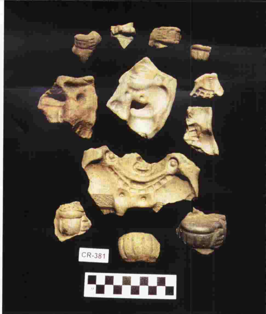
Figurine molds and bodies also from the northern Ulua Valley. The woman holds a clay pot. Figurines like this were imported into the Copan Valley for the use of the Maya nobility.