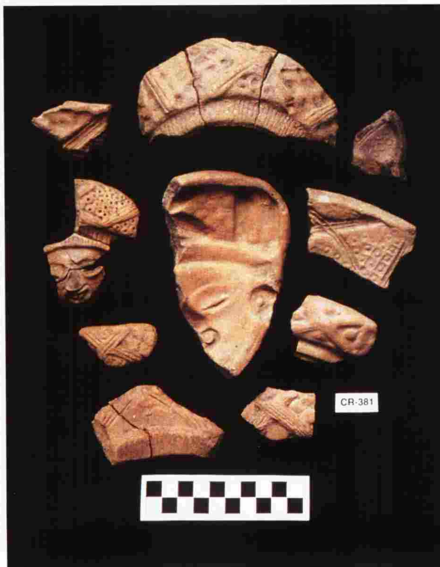
BOTTOM: Figurine molds and heads from a small site in the Lower Ulua valley excavated in 2001. The molds were used to produce figurines wearing turbans made of folded cloth, one of the most common headdresses found at Copan. In contrast to Copan, where they are almost unknown, molds are common in large and small communities in the Ulua region.

Some of these young adults have teeth that look like they have been filed or artificially reshaped, another practice we know was carried out by people of high social status in Maya society. The second type is someone who is clearly old, with many wrinkles and the sunken cheeks of a person who has lost some teeth. These old people appear to be in some pain or at least look more troubled than their young counterparts, with open, twisted mouths or faces.