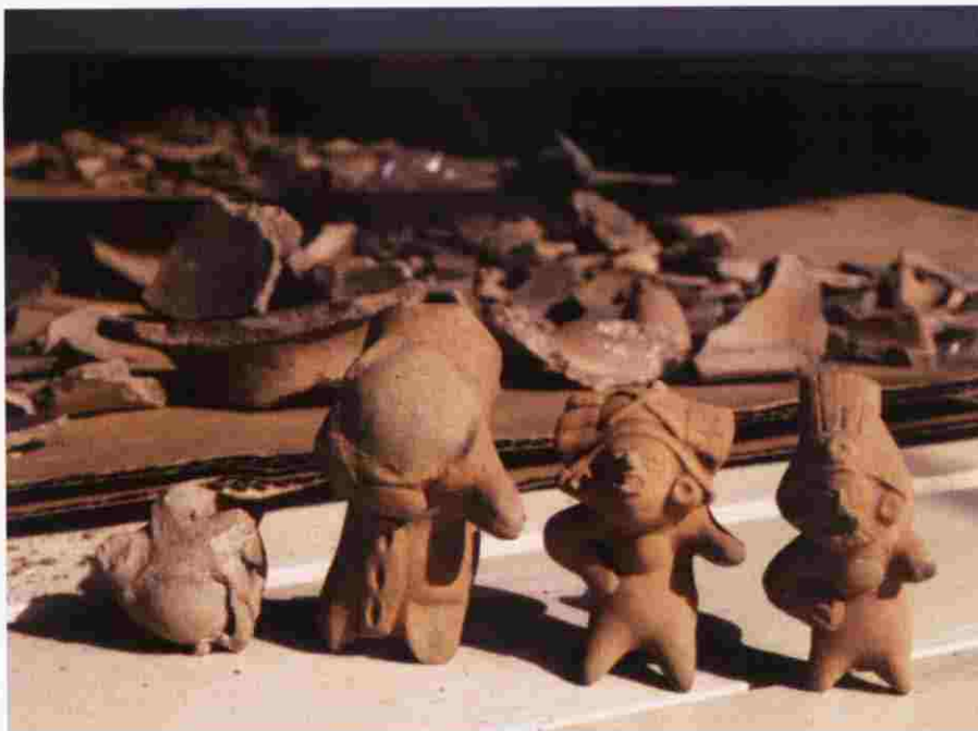
TOP: Figurine-whistles from northern Honduras, confiscated by the Honduran Institute of Anthropology and History, as part of their ongoing efforts to control the looting of archaeological sites.