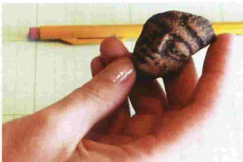
A figurine head from my 2002 excavations at Cerro Palenque in the Lower Ulua Valley. Stylistically similar to ones found at Copan, it demonstrates the calm expression and youthful aspect of most representations of humans.

think about how figurines reflect the beliefs and cultural values of the people living in Mexico and Central America before European contact. Good archaeological provenience allows us to know the kinds of settings in which figurines were typically used, what kinds of imagery are emphasized, and where they were made.