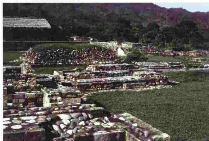
ABOVE: Members of the Copan nobility lived in large residential compounds such as this one. Most of the figurines came from trash deposits located behind houses. Other buildings in the compound include storage buildings, kitchens, and temples, such as the central building in this photograph.

The fact that we find broken figurines in trash deposits does not mean that these objects had no value or were treated with indifference. The Copan residential trash deposits contained