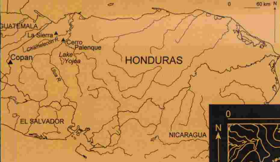
LEFT: Map of southeastern Mesoamerica showing the major sites mentioned in the article.