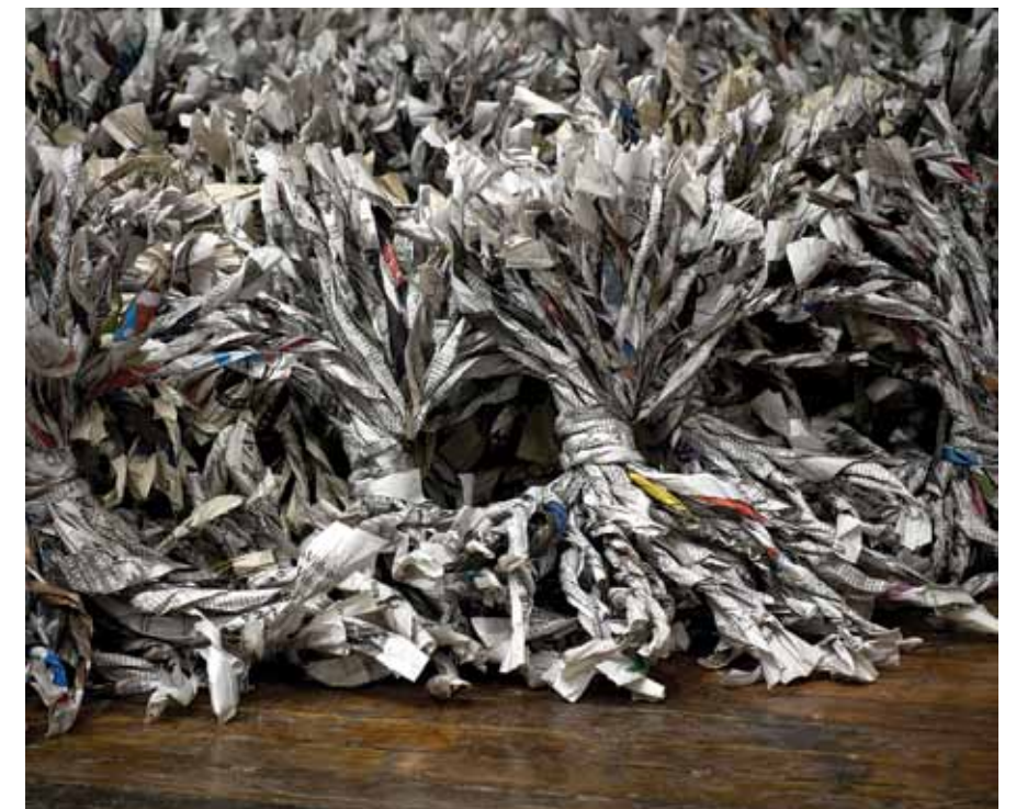
TOP The River , 2005 12 minute 10 second video, branches, debris, New York Times newspapers, dimensions variable,

This is the story of my Father's family. All the past washes downriver, leaving debris as in the wake of a terrible flood.