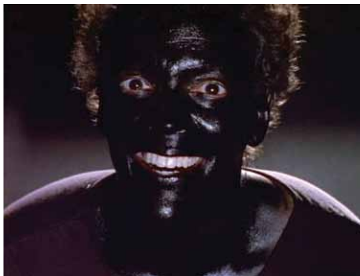
Daily Mask , 2004 16mm film, 3 min. 22 sec.

African-American characters in conformity with white audience's desires and perceptions of race. Typically, white men would don blackface makeup and costume for white audiences' entertainment. After the popularity of this performance took hold, black men would also perform in similar garb for these same viewers. In contrast to these public precedents, Hassinger performs her "blackface" in Daily Mask alone in the mirror before her. Hassinger's eyes close, and the contours of her face recede into darkness. She denies the display of grotesque contrasts characteristic of historical blackface (bulbous eyes and exaggerated lips), and instead, her face appears as a solemn, almost abstracted mask. This formal gesture intentionally acknowledges the art-historical interest in "modernist primitivism," specifically the influence of non-western, "primitive" objects on European and American artists in the beginning of the twentieth century. Her "mask" evokes the wild visages of the fearsome prostitutes in Pablo Picasso's Demaiselles d'Avignon (1907), faces modeled on the design of African objects. Moreover, Hassinger's almost ritualistic application of her make-up recalls a similarly voyeuristic interest in war-painted Native Americans.