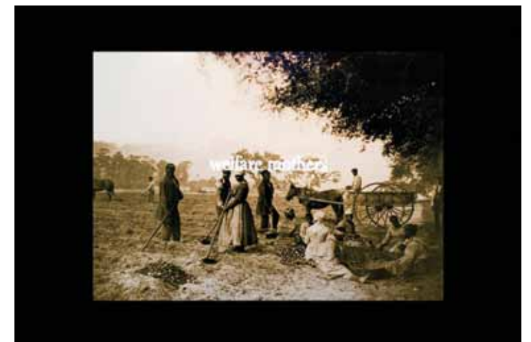
Legacy , 2006 26-minute video, archival photograph