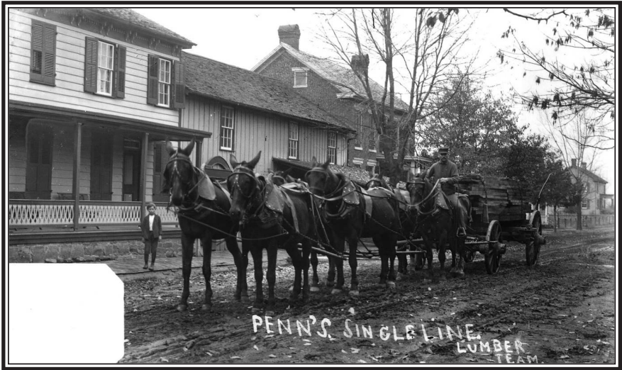
View of Fairfield lots 15S, 16S, and 17S