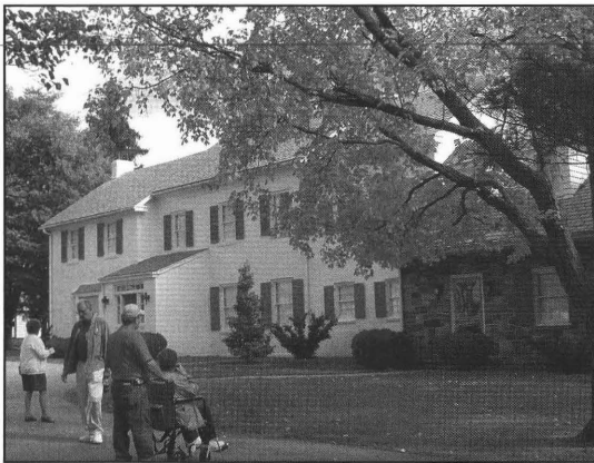
A view of the west wing of the Eisenhower House. The site has been open to the public since 1980.