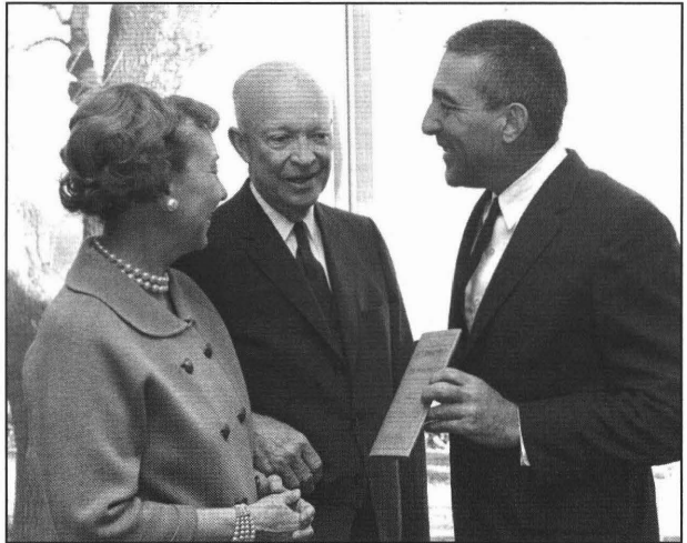
Secretary of the Interior Stewart Udall chats with the Eisenhowers at their farm in November 1967, when the Eisenhowers formally conveyed their property to the federal government as a national historic site.

The farm and buildings the Eisenhowers purchased needed a substantial overhaul to satisfy the General, then serving as President of Columbia University in New York—and soon to become 34th President of the United States. It took roughly four years to rebuild the farm house to the Eisenhowers' specifications. During the White House years, it would serve primarily as a weekend and holiday retreat from the pressures of Washington. In the Fall of 1955, however, the farm morphed into something larger—an