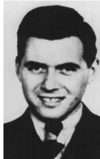
Joseph Mengele.