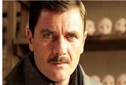
Portrayal of Mengele in the film.

In the first scene of The German Doctor , the audience is introduced to Josef Mengele. Although, his true identity is not revealed until one of the final climactic scenes, Mengele's identity can be inferred from the outset. However, the film is about the family that Mengele encounters more so than it is about Mengele himself. Therefore, the film leaves it to the viewer to get a true understanding of who Mengele was. 19 It is important to examine Mengele and where he came from, as it shapes his actions throughout the film. As one of the most infamous people from one of history's most infamous time periods, Mengele's inclusion as a central character in the film fuses the historical narrative within the film's historical fiction narrative.