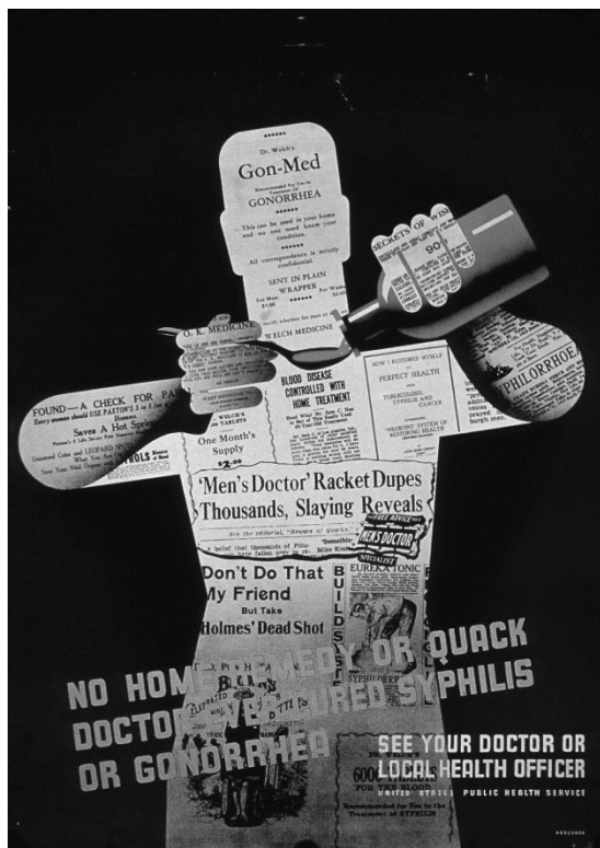
Figure 1: “No home remedy or quack doctor ever cured syphilis or gonorrhea” was a poster made by the Public Health Service to combat the widespread reliance on cures that were ineffective and not medically sound.

“No home remedy or quack doctor ever cured syphilis or gonorrhea” United States Public Health Service, n.d. NIH National Library of Medicine Digital Collections , accessed November 8, 2016, https://collections.nlm.nih.gov/catalog/nlm:nlmuid-101450677-img .